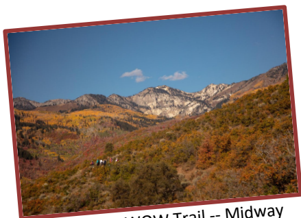
Lower WOW Trail -- Midway