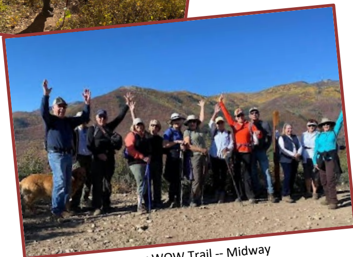
Lower WOW Trail -- Midway