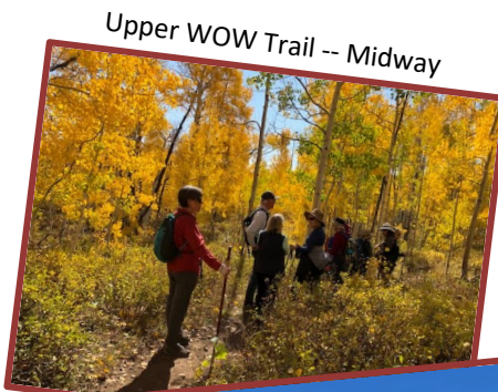
Upper WOW Trail -- Midway