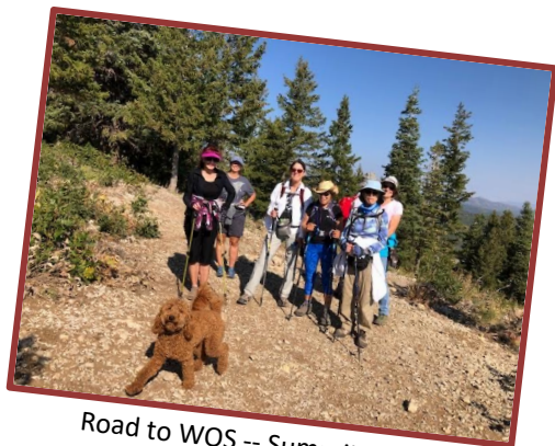
Road to WOS -- Summit Park