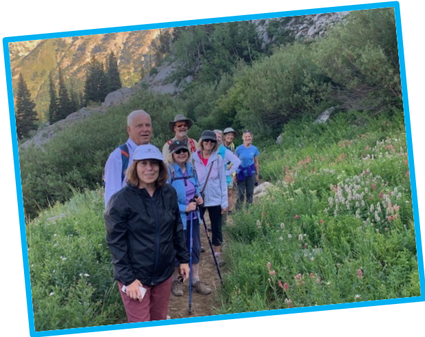
Catherine's Pass hike at Alta