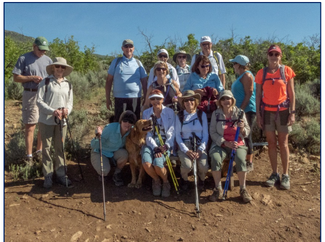
And our June hike at Dutch Hollow