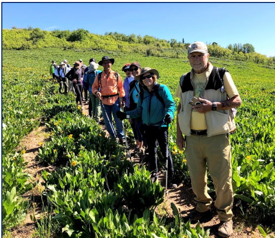
From our recent hike on Big Mountain Pass