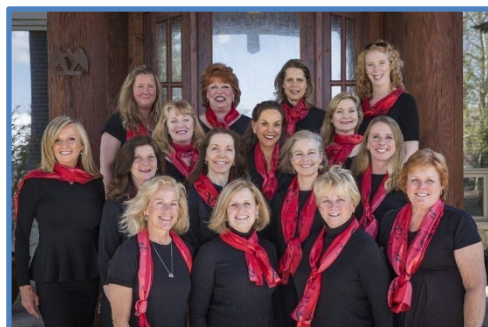
The Park City Treble Makers, a women's A Cappella Choir.

PARKING: Parking at the Christian Center (CCPC) itself is often limited. There are spaces across Deer Valley Dr. on Sullivan Rd. along the playing fields and tennis courts—after parking there, you can walk to the convenient pedestrian underpass for easy access to CCPC. In the other direction, there is a large parking lot at Walgreens , then a very short walk up to the venue via Shortline Rd. Please carpool if possible and allow a few extra minutes for a little walk.